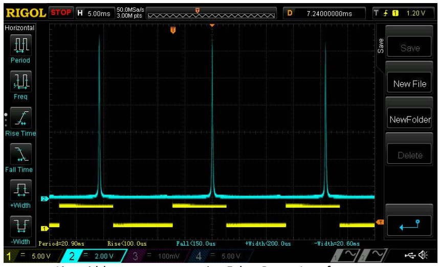
Linewidth measurement using Fabry-Perrot Interferometer